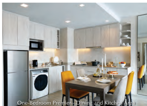
One-Bedroom Premier - Dining and Kitchen Area