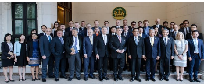
EU-ASEAN Business Council Mission on 17 th - 19 th February 2020