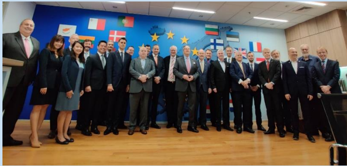
Advisory Council Second Meeting 22 November 2019

Education: a long-standing issue of interest to EABC.