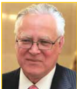
Georg M. Wolff Civil Engineering Solutions (Thailand)